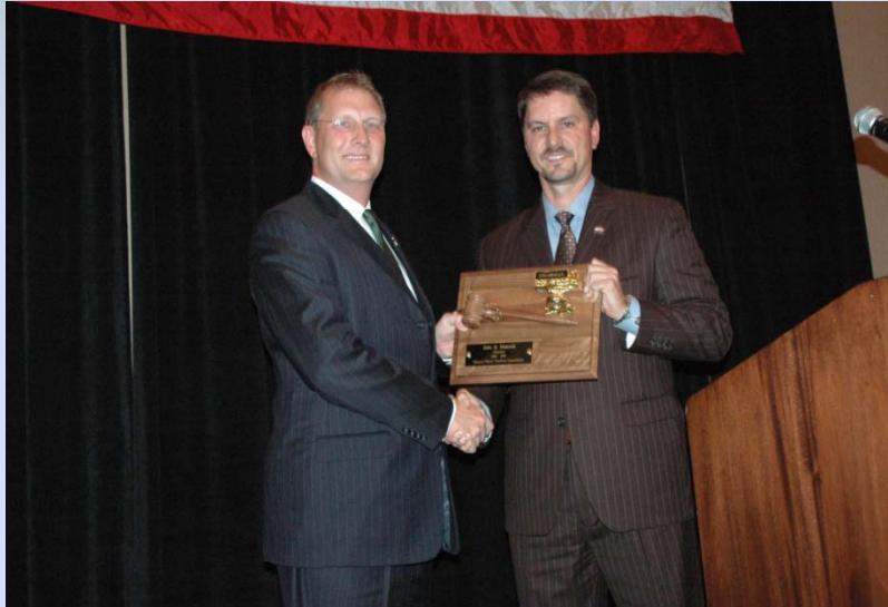
2009 MMCA CHAIRMAN