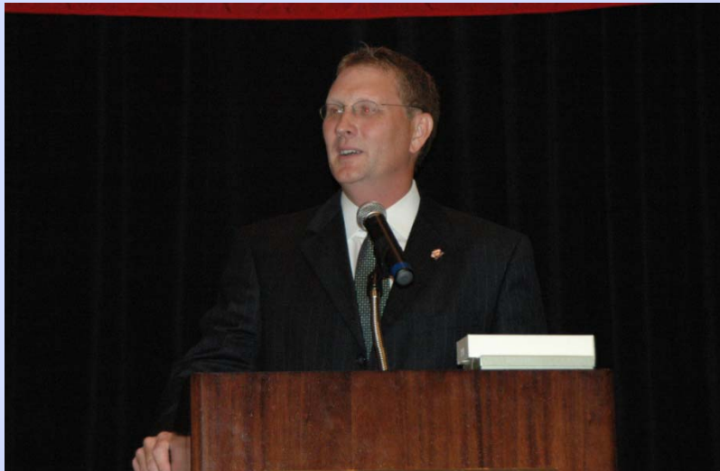
2009 MMCA CHAIRMAN FAREWELL